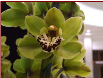
Gentle Touch 'Bon Bon' Max Kahlbaum