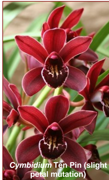
Cymbidium Ten Pin (slight petal mutation)

Plants bred either directly or indirectly from C. Ruby Eyes now number in the hundreds. C. Ruby Eyes alone has been used as a pod parent at least 15 times and as a pollen parent at least 80 times. This plant is still being used in breeding programs and will probably continue to contribute for years to come. Its primary use is in the breeding of red pendulous, miniatures and intermediate Cymbidiums. This large number of offspring and its continued use in breeding programs is remarkable considering it is 31 years old. That is amazing staying power for any hybrid. Hopefully if we continue to use this outstanding plant we will select and use cultivars that do not exhibit genetic mutations. If we use 'clean' plants of C. Ruby Eyes and its offspring we will certainly be in-the-black financially but in-the-red in regard to high quality, high colour cymbidiums.