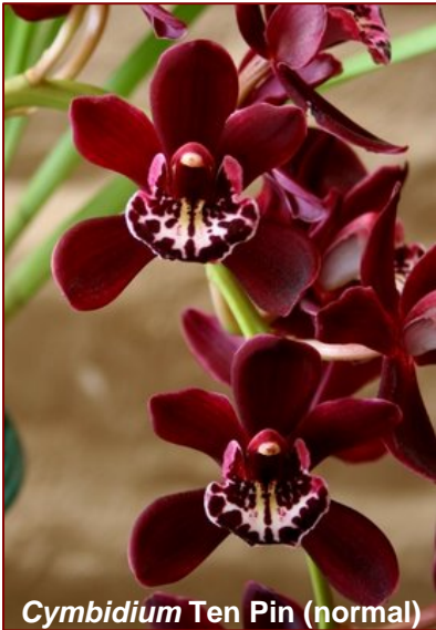
Cymbidium Ten Pin (normal)

there that have collections of both Petal and Sepal Pelorics. To me it is the equivalent of Hip Displasia in German Shepherds. The kennel clubs try to eliminate from the breeding program dogs that exhibit the trait. Maybe we should do the same if we want to breed stable, high quality plants. To this end, I make the outlandish suggestion that we should eliminate C. Ruby Eyes 'Red Baron' from future breeding. I qualify this by adding that those 'Red Baron' with the petal deformity. There is strong evidence that not all the 'Red Baron' out there are the genuine cultivar. If you need an example of this go to your friendly web-based image browser and see the variation in what is called C. Ruby Eyes 'Red Baron'. Be particularly careful when purchasing meristem produced plants.