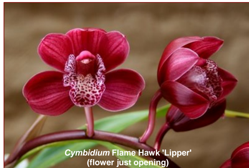
Cymbidium Flame Hawk 'Lipper' (flower just opening)