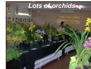
Lots of orchids