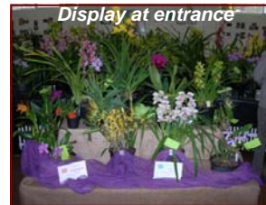
Display at entrance