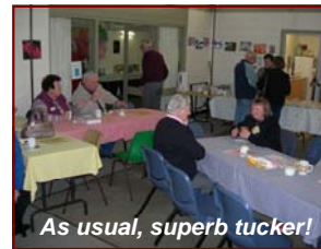
As usual, superb tucker!