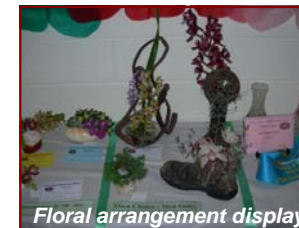
Floral arrangement displays