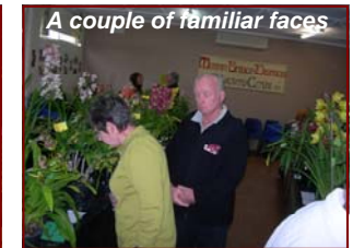
A couple of familiar faces